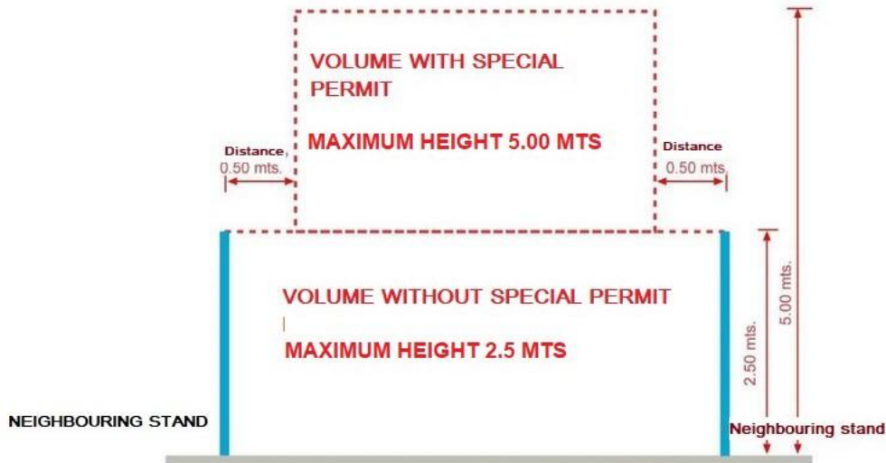
Front elevation diagram